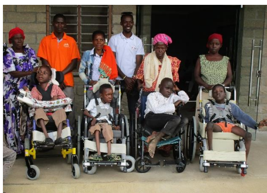
Some of the new chairs